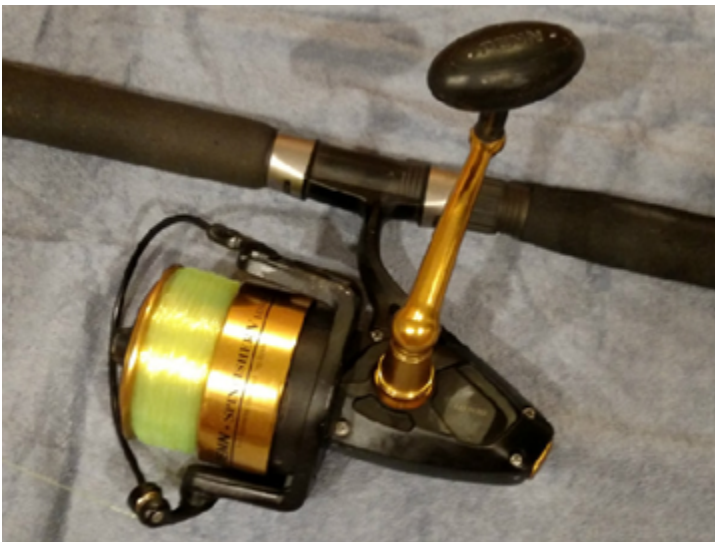
Penn SPINFISHER V Model 10500 with 250 yds of 50lb mono.

Large spinning reels can be used as well. The reason the spinners should be large is that they need to accommodate a lot of line. Regardless of the reel you choose, your reel needs to hold 250-300 yards of line.